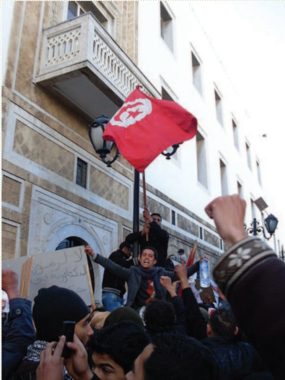
Figure 0.2 Anti-government demonstrations during the 2010–11 Tunisian uprising