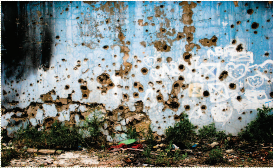
Figure 0.1 Graffiti, Sarajevo 2005

cuts, elections, salacious scandals, and so on. And so goes the daily round of international relations – war and peace, poverty and underdevelopment, global attention and global neglect.